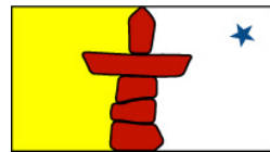
Commissioner of Nunavut Vice-Prior of Nunavut Hon. Eva Qamaniq Aariak C.M., O.Nu, DStJ