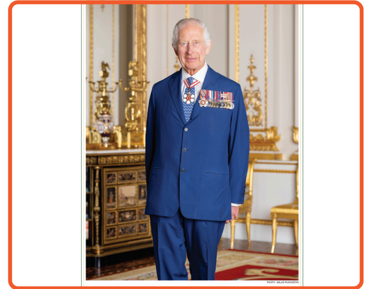
King Charles III is the Sovereign Head of the Most Venerable Order of the Hospital of St. John of Jerusalem

The Motto: "Pro Fide, Pro Utilitate Hominum," which means "For the Faith, In the Service of Humanity."